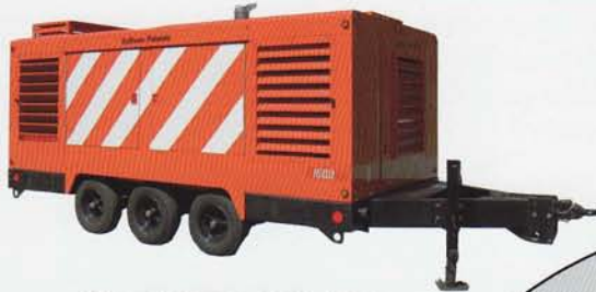
1300 CFM TO 1800 CFM