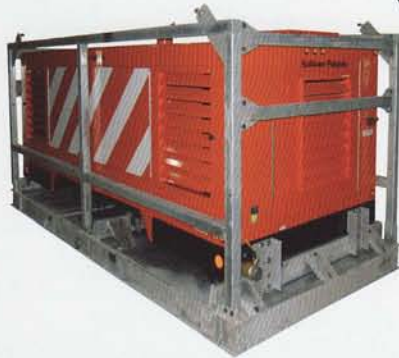
185 CFM TO 1800 CFM OFF SHORE COMPRESSOR