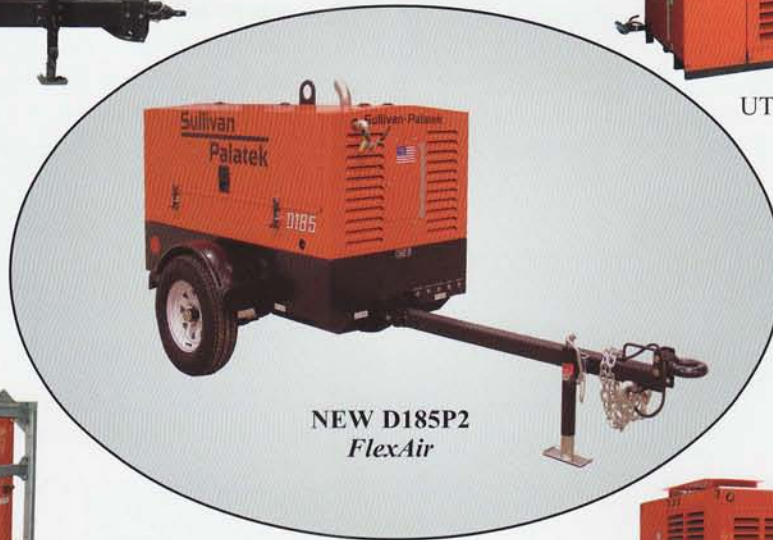
NEW D185P2 FlexAir