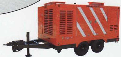
750 CFM TO 900 CFM