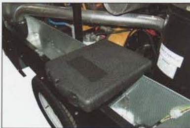
Manual Holder (optional) Equipped with Operating Manual Holder

Optional Panel: The optional panel consists of standard panel plus air oil separator indicator; tachometer; air filter indicator; fuel solenoid circuit breaker and starter breaker switches, discharge air temperature, voltmeter gauge, and ether starting.